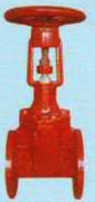
GATE VALVE RISING STEM