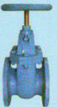
GATE VALVE NON RISING STEM