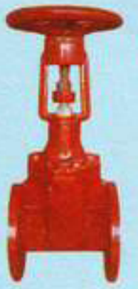
GATE VALVE RISING STEM

SUITABLE FOR WATER WORKS AND SEWAGE SYSTEMS