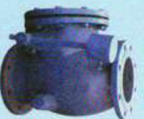
NON RETURN VALVE