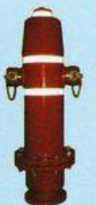
VERTICAL FIRE HYDRANT