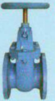
GATE VALVE NON RISING STEM